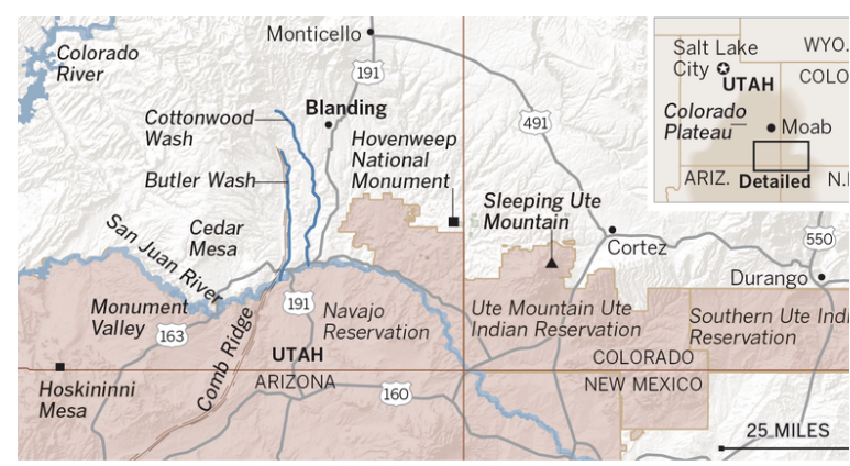
Sources: Bureau of Indian Affairs, USGS, ESRI, National Park Service Lorena Elebee@latimesgraph

Archaeologists and Native American leaders decried the destruction, and Congress made it a felony to take ancient items worth more than $500 from public or Indian land.